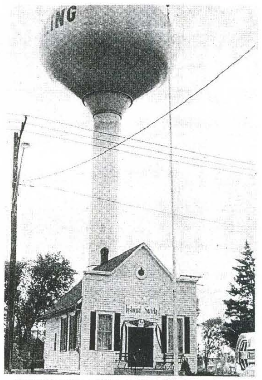
Incorporated into a village in 1894, Wheeling built a small village hall for its new government. Above, the old village hall, now the Wheeling Historical Society, is dwarfed by the modern Water tower and electric lines. This fall, Wheeling will move into it's third village hall, on Dundee Rd.